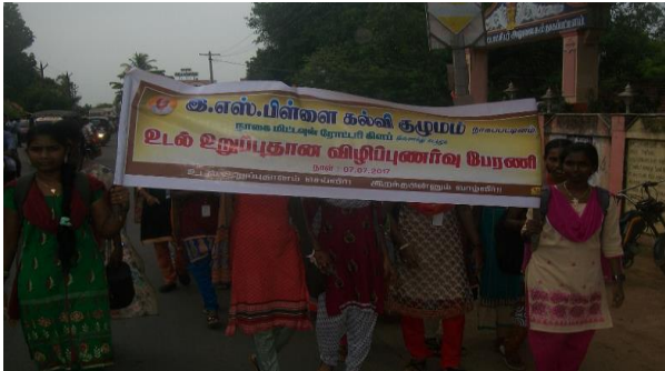
Organ donation Rally