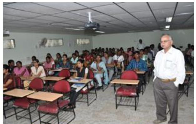
Quality Improvement Cell