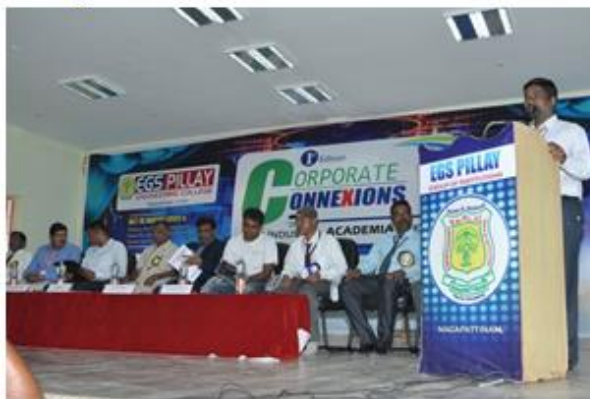
ICTACT – HR Conclave