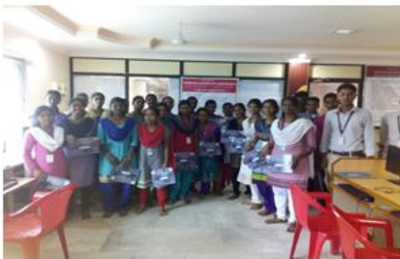
Programmers Paradise Club –E-Box Course