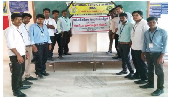
Disaster reduction day