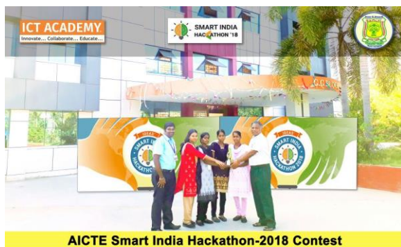
AICTE Smart India Hackathon-2018 Contest